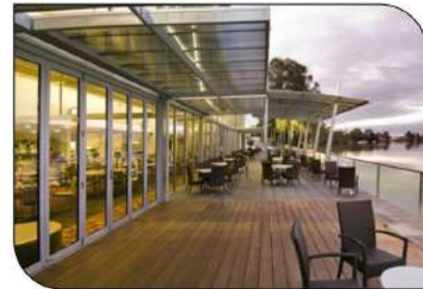
Aluminum & Glass