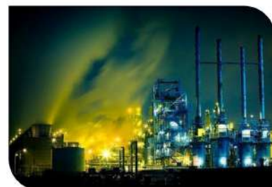
Refineries/ Petro Chemical