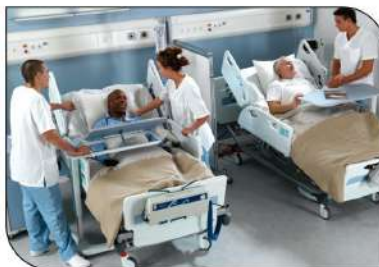
Hospital & Medical