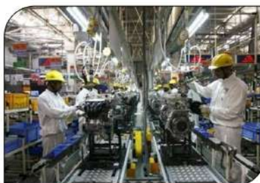
Production & Manufacturing