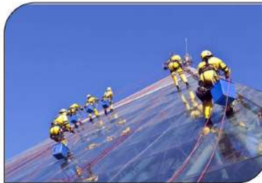
Hotel Cleaning & Management